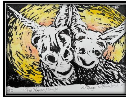
"The Happy Couple" (Lino Block Print)

"I hope you enjoy viewing my work as much as I did creating them!"