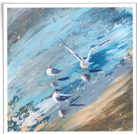
"Melbourne Gulls" 2019 Juried Member Art Exhibit