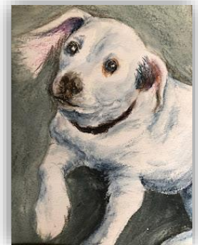
"Lucy" (pet portrait)