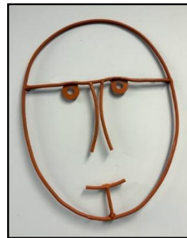
Norbert Snyder (metal art)