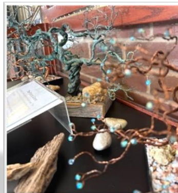
Bertha Lomand (wire art)