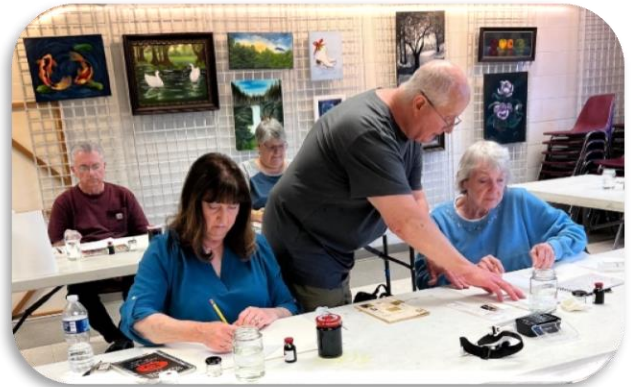
communication ♦ creativity ♦ respect