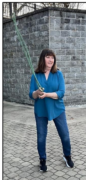
the art of beautiful writing... let your body feel the movement