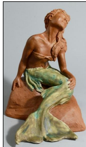
The Song of the Sea

The underlying thread in my journey has been growing to understand what it looks like to integrate the truth of my relationship with Christ and my expression as an artist. I am learning to let my creative process develop in such a way that it reflects the complicated dynamic of my Faith – something which is not always pretty or positive or well understood, but which carries underneath it the reality of Hope.