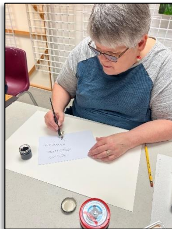
learning the scales ~ practice & repetition