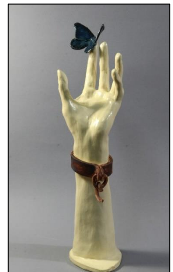
Transformed by Hope