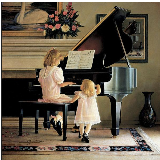
"Dress Rehearsal" by Greg Olsen 1993 (oil on canvas)